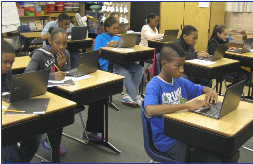
While each school's needs are different, many are adding cost-effective Chromebooks to local classrooms.