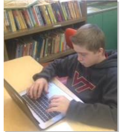
This student works on a Chromebook in a one-to-one classroom.